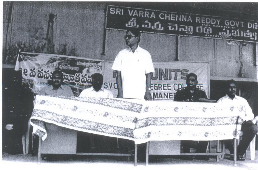
'62nd VANAMAHOCHAVAM' activities conducted by NSS Volunteers with the support of Municipal Commissioner of Palamaner and The Forest Range Officer, PALAMANER.