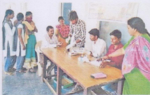
నమూనాల కోసం ప్రత్యేక రక్తపరీక్షలు చేస్తున్న సిబ్బంది