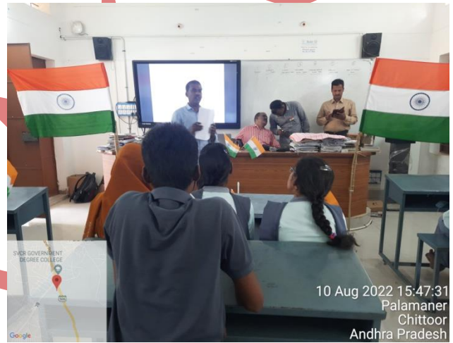
10 Aug 2022 15:47:31 Palamaner Chittoor Andhra Pradesh