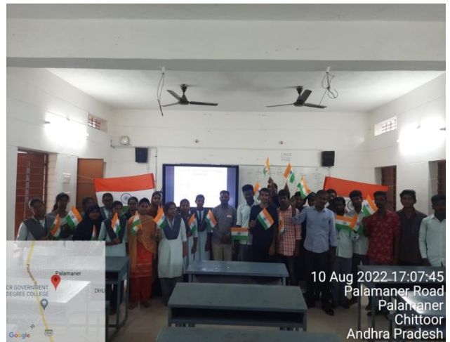
10 Aug 2022 17:07:45 Palamaner Road Palamaner Chittoor Andhra Pradesh