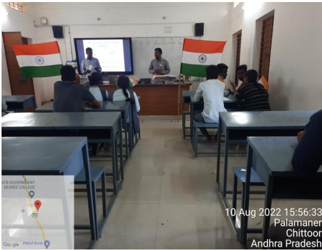
10 Aug 2022 15:56:33 Palamaner Chittoor Andhra Pradesh