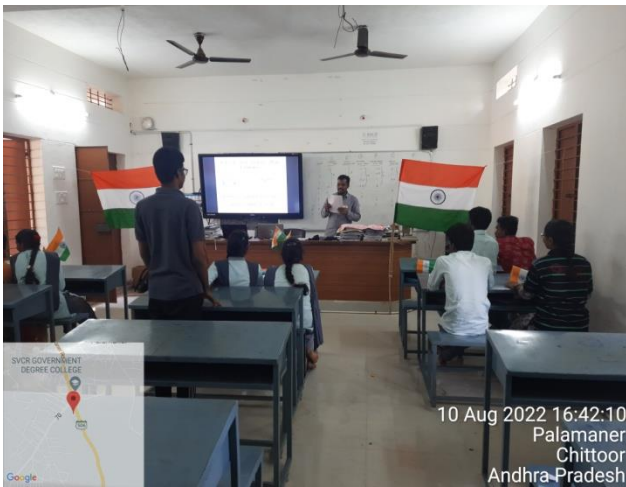
10 Aug 2022 16:42:10 Palamaner Chittoor Andhra Pradesh