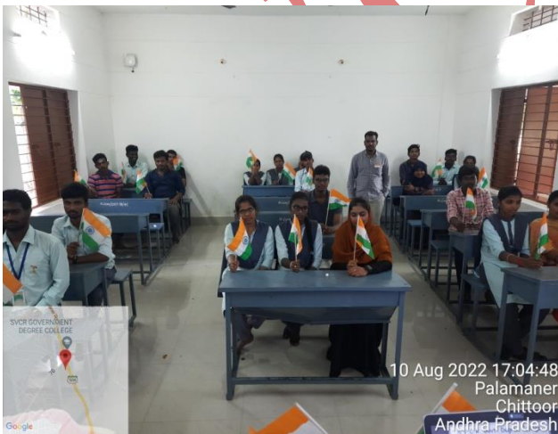
10 Aug 2022 17:04:48 Palamaner Chittoor Andhra Pradesh